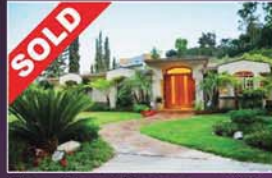
SOLD Chevy Chase 4 Bedroom x.4995 Represented Buyer