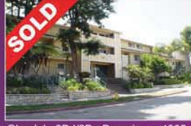
SOLD Glendale 2Bd/2Ba Bargain x.4995 Represented Seller & Buyer