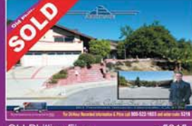
SOLD Old Phillips Fixer x.5215 Represented Seller & Buyer