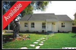
Available Turnkey in Valley Village x.5285 Newly remodeled throughout!