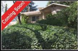
Coming Soon! Verdugo Woodlands x.5475 4 Bedroom in Tranquil setting