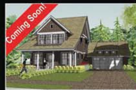
Coming Soon! Turnkey 3 Bedroom in BBK x.5395 New floors, kitchen & baths