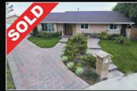
SOLD Porter Ranch x.4995 Represented Buyer