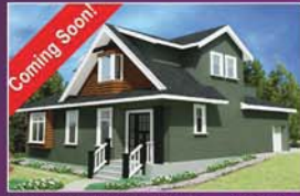
Coming Soon! Valley Village 3 bedroom x.5404 Pool 12,900 sq.ft. lot!