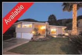
Available Glendale/College Hills x.5335 4 Bed / 3 Ba / ~3,000 sq.ft. / Great lot