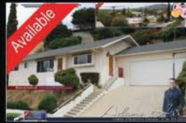
Available Excellent Adams Hill location x.5365 Vaulted Ceiling w/ Views Views Views