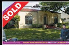
SOLD Glendale 4 Bd. Fixer x.5295 Represented Seller