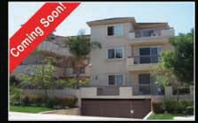
Coming Soon! Newer Glendale Condo x.5415 Represented Buyer