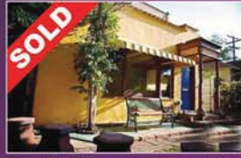
SOLD Glendale Starter x.4995 Represented Seller & Buyer