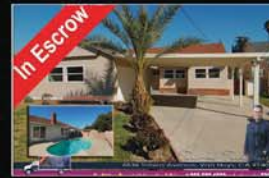
In Escrow 3 Bedroom with Pool x.5265 Representing Seller