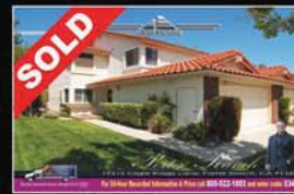
SOLD Gated in Northridge x.5345 Represented Seller