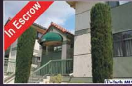
In Escrow Burbank Starter x.4995 Representing Seller