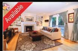
Available Royal Canyon Beauty x.5385 2,748 sq.ft. / 4 Bed/3 Ba / Private