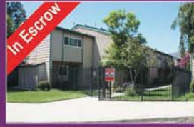
In Escrow Short Sale Approved! x.4995 Representing Buyer & Seller