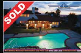
SOLD Old Phillips 5 Bedroom x.5225 Represented Seller & Buyer