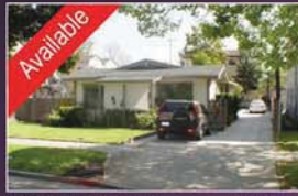
Available 3 Units in Glendale x.5425 $3,320 monthly rental income