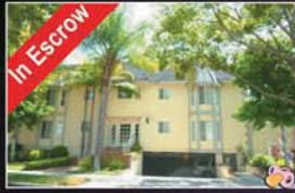
In Escrow Glendale x.4995 Representing Buyer