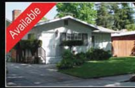
Available NW Glendale Starter x.5355 2 Bedroom home priced like a condo!