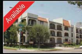
Available Prime Glendale Condo x.5315 Top floor corner unit - move in ready!