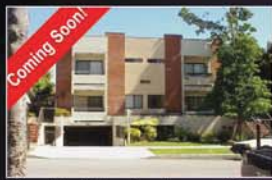
Coming Soon! Glendale Starter Condo x.5485 New floors, gated, end unit