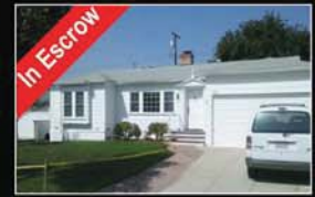
In Escrow Burbank Family Home x.4995 Representing Buyer