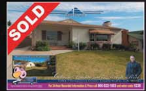
SOLD Eagle Rock Charming x.5235 Represented Seller