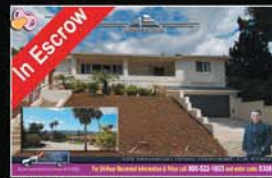
In Escrow NW Glendale View Home x.5305 Representing Seller