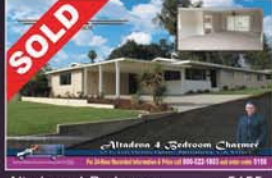
SOLD Altadena 4 Bedroom x.5155 Represented Seller & Buyer