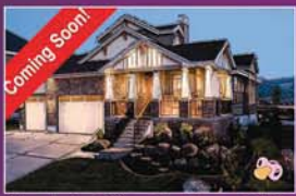
Coming Soon! Greenbriar 2 Story Trad'l x.5455 4 Bedrooms / Pool / 3,800+ sq.ft.