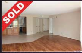
SOLD Glendale Starter Condo x.5435 Turnkey, low HOA, hw floors