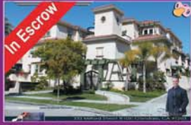
In Escrow Glendale 2 Bedroom Condo x.5275 Representing Buyer