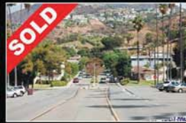
SOLD 3 Units in Rossmoyne x.4995 Represented Buyer