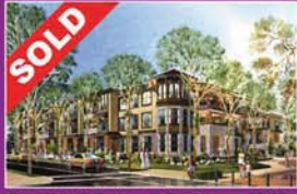
SOLD Glendale 2 Bedroom Condo x.4995 Represented Buyer & Seller