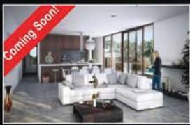
Coming Soon! Modern Fixer in NW Glendale x.5465 Great opportunity w/ the right touches

Simply call our 24-hour Recorded Hotline at (800) 522-1803 and enter the appropriate extension for more information.