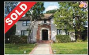
SOLD Verdugo Woodlands 4 Bm x.4995 Represented Buyer & Seller