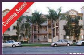
Coming Soon! Burbank New Condo x.5495 High Ceilings / First level