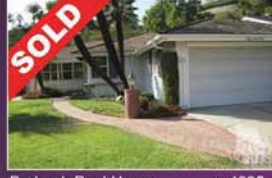
SOLD Burbank Pool Home x.4995 Represented Buyer