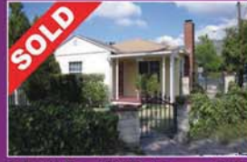
SOLD 2 Bed/1 Ba w/ RV Parking x.4995 Represented Buyer