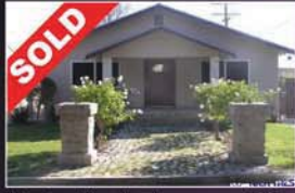
SOLD Verdugo Woodlands x.4995 Represented Buyer