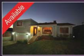
Available Burbank Turnkey Gem x.5245 2,000 sq.ft. / hw floors / New kitchen