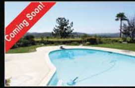
Coming Soon! Greenbriar 5 Bedroom x.5375 Pool / View / 3,200+ sq.ft.