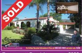
SOLD Rossmoyne Spanish x.5255 Represented Buyer