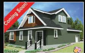
Coming Soon! 3 Units in Upper Glendale x.5445 All 2 bedrooms/1 bath