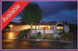
Available Glendale 4 Bedroom w/ view x.5145 Present w/ only 2 bedrooms!