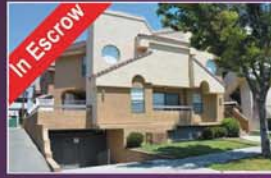
In Escrow Great opportunity in Glendale x.4995 Representing Seller